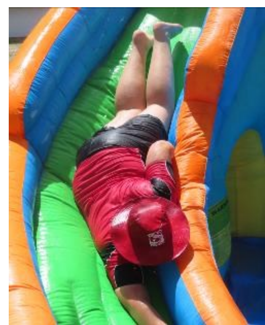
Issue 4, Term 4 2024