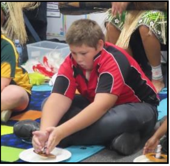
Pentland joined our students in a performance from Musica Viva. Heith participated in the spinning tops race to see who's can spin the longest.