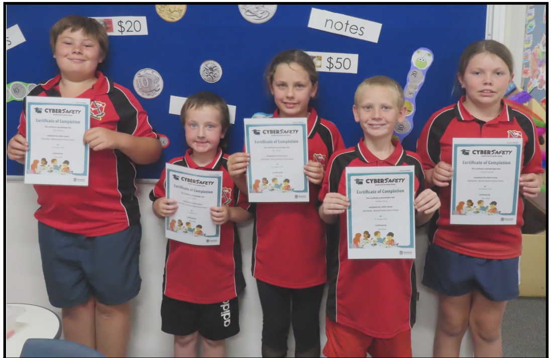
This term in Health, students participated in a Cyber Safety course. Learning how to stay safe while using social media, gaming and other online activities.