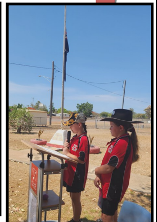
Thank you, students, staff, families and community members for attending our Remembrance Day Service. Thank you for joining us for morning tea.